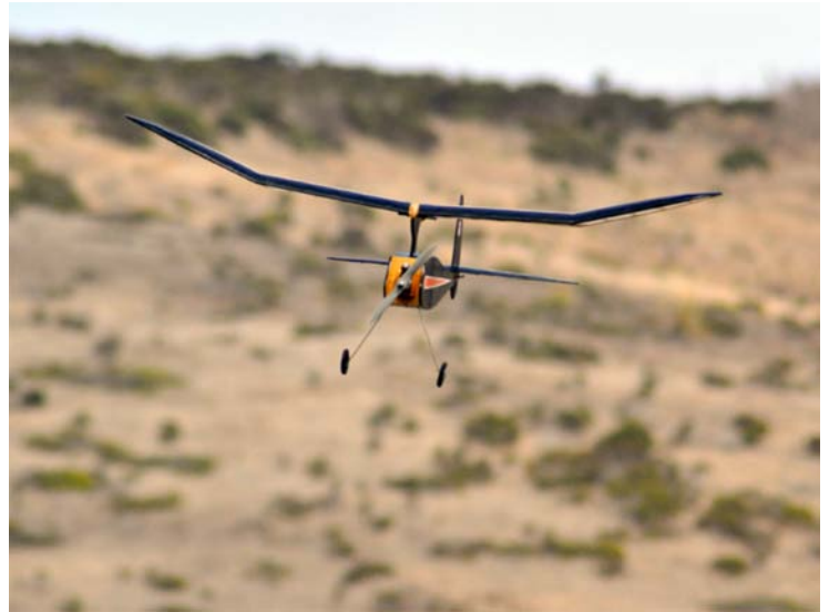
Jake's Mini Playboy on final.