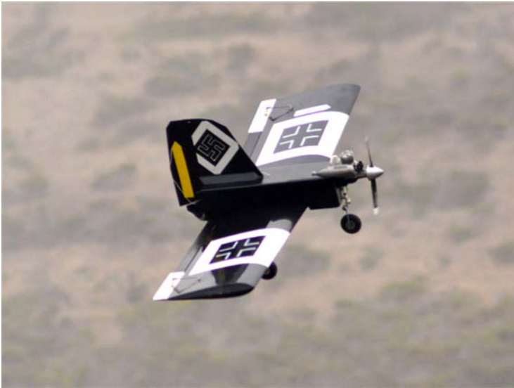
Something that Ellsworth has! It is a nice flying "thing".