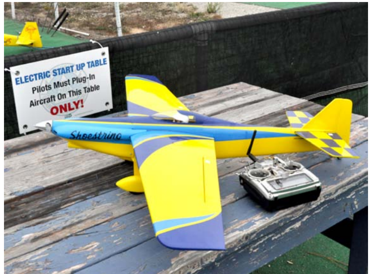
Mike's Shoestring EF-1 pylon racer, it was last seen heading south.....