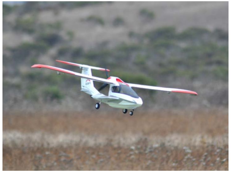
Bruce's Icon A5 on final approach.