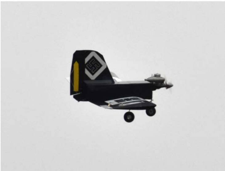
What could this be?