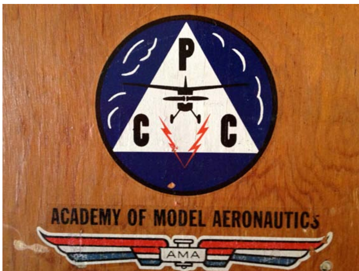
Original PCC logo