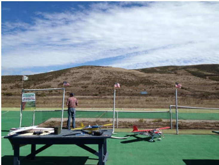
Last Saturday was beautiful at the field. Light Breeze, warm!