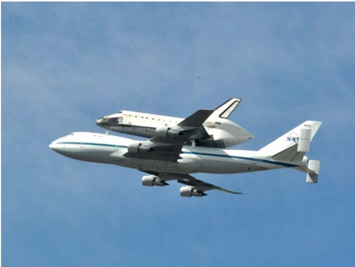
Space Shuttle Endeavor flies over Ames. (I know, it could be anywhere!)