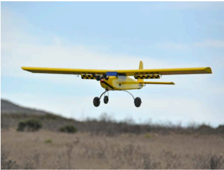
Perfect example, a little more Tai Chi would have prevented this perfect "dead stick" landing!!