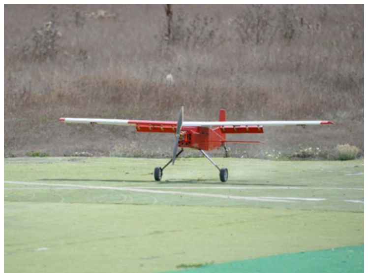
Bruce D's Skywing, an electric tow plane for gliders.