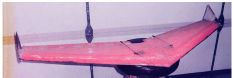
Zagi Wing (glider), 48" span