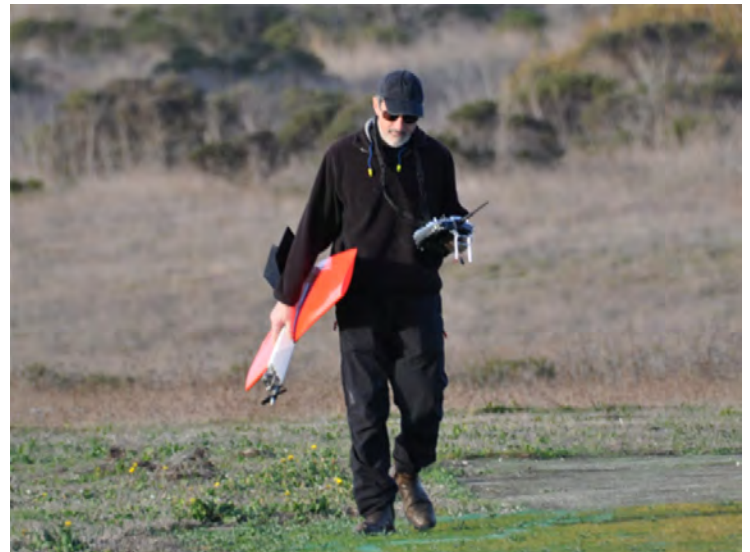
Geppetto after landing.