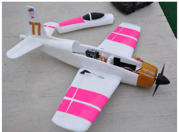
This one belongs to Cruz.