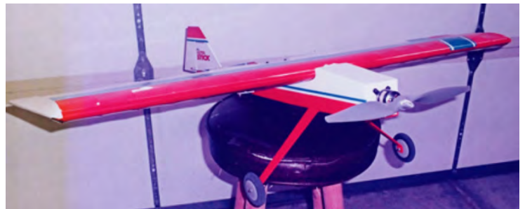
E-Flite Mini Ultra Stick 450, 39" span