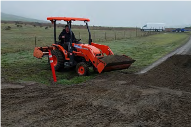
Play with dirt in the rain!