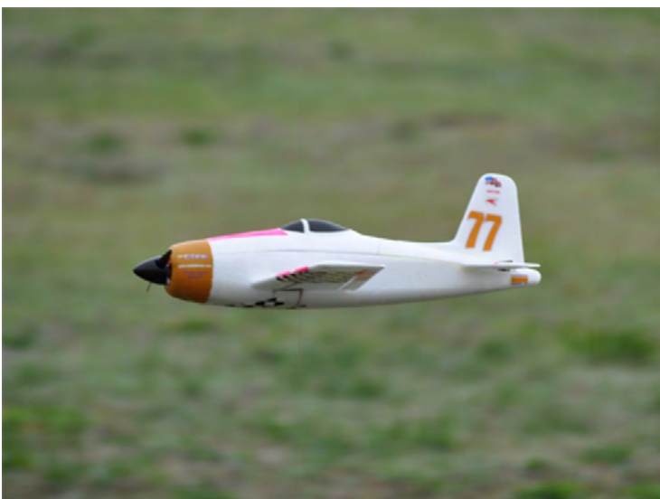
Here is what it looks like in the air.