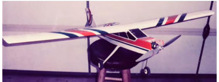
E-Flite Alpha 450, 49" span