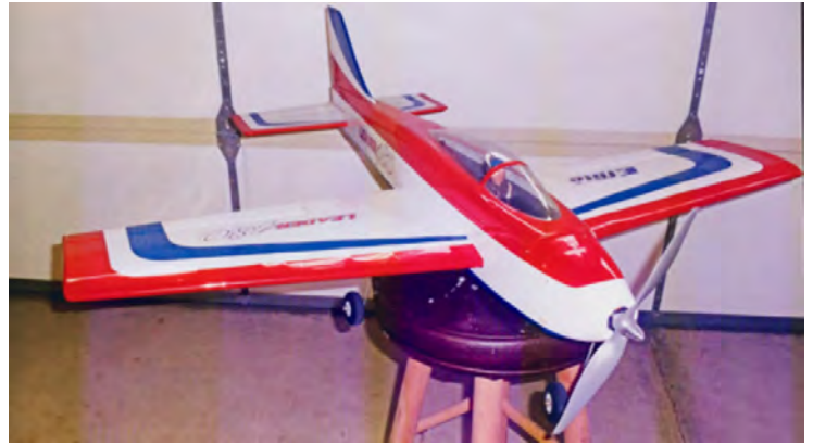
E-Flite Leader 480, 44" span