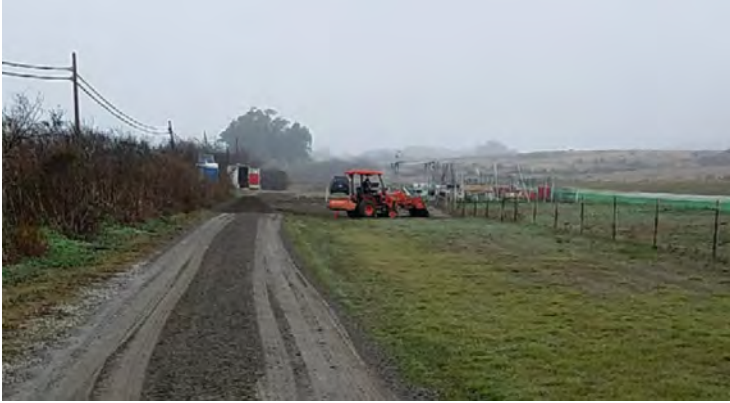
Mike S on the backhoe spreading the dirt!

The dirt (actually crushed concrete) is finally in place. Some of you already drove on it! The dirt was delivered on January 5th, All 87 tons of it! Mike S and Mike P were out there in the rain for 5 hours spreading the crushed concrete to where it needed to be. Great job, thanks guys! I think Mike S was very happy driving the big Tonka toy! When you see them at the field, give them a big thank you!