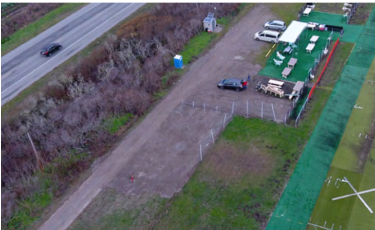
The member and visitor parking area.