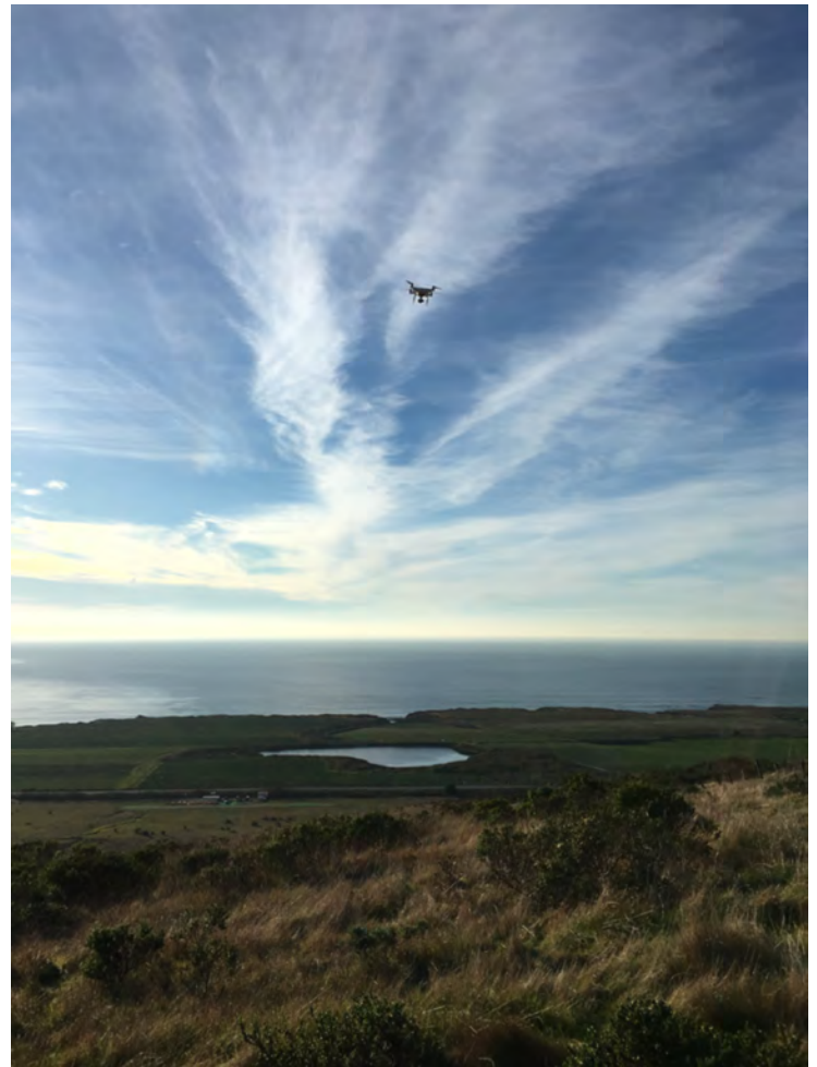
Brian's Phantom captured by Norine.